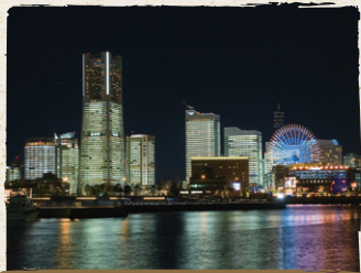
1 Night view of Minatomirai

Yokohama is a leading tourism and leisure destination of Japan. It is known for its exotic ambiance, with an amalgamation of the historic and the contemporary. This photogenic city attracts people of all interests.