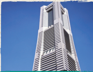
2 Landmark tower

Minato Mirai is a Modern seaside area with major tourist sights of Yokohama City with number of restaurants and shops. The night view of Minato Mirai is astonishingly gorgeous.