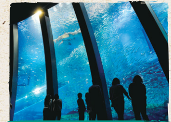
6 Yokohama Hakkeijima Sea Paradise

A very famous local bakery at the end of the Motomachi shopping street with variety of freshly baked delicious breads.