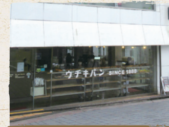
5 Uchiki bread

Kirin is a popular company that has a long history of beer in Japan. The Kirin Yokohama beer factory offers free tours of its large brewery as well as beer tasting bar for the visitors.