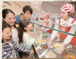
3 Cupnoodles Museum

Yokohama Landmark Tower is the 4th tallest structure in entire Japan. The deck of landmark tower offers an amazing view of Mount Fuji.