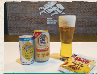
4 Kirin Brewery Yokohama Factory

The Cup Noodle Museum is a popular food museum known for its instant Ramen noodles. The museum exhibits the history of Instant Ramen and the Visitors here can even make their own DIY cup noodles and carry back with them.